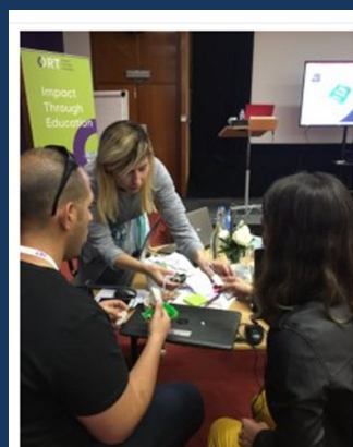
The participants worked together on projects throughout the week

"I feel that the Hatter Seminar has not only impacted me professionally, but I feel that it has had a big impact on me personally too. Professionally, I sometimes face issues as a maker and trying to bring in new ideas into a profession that has been around for centuries has its difficulties – but I know now that I have a very big support system, not only in my school, but thanks to this last week, around the world. We laughed, we learnt, we collaborated, we shared, we failed and kept trying. It was the true essence of what Maker Culture is all about and I am truly fortunate to have been a part of it all thank you so much."